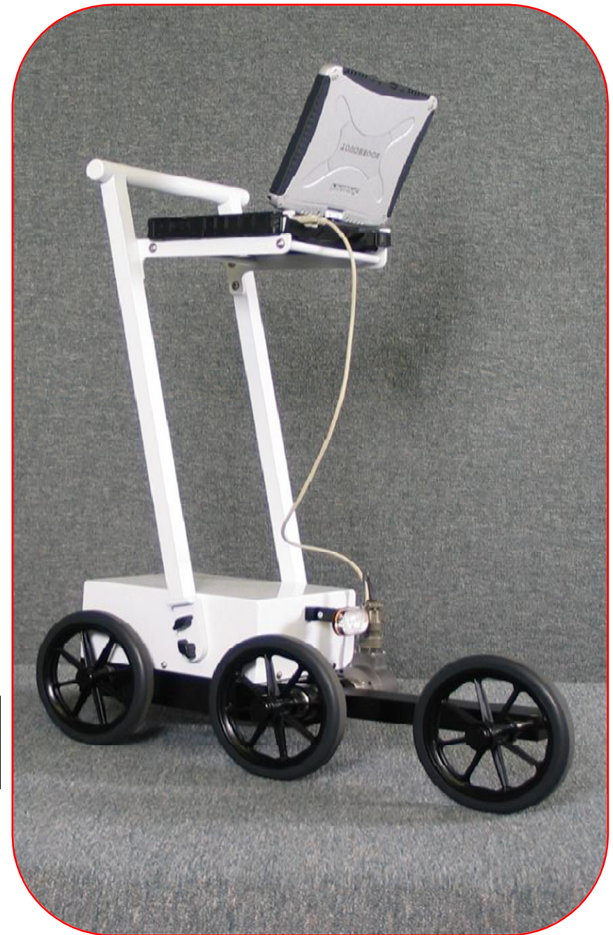
SSI CS8800 Walking Profiler