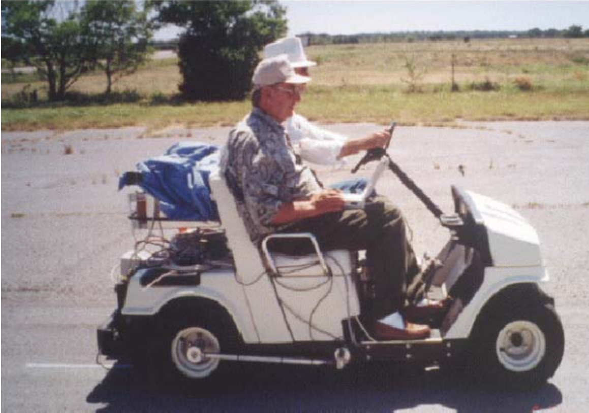
Figure 10-4. Illustration of a lightweight inertial profiler developed by TxDOT.