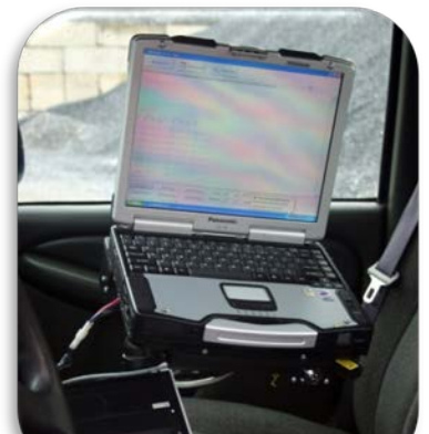
▲ Computer Instructed Calibration and Data Collection Routines ▲