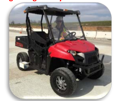
▲ CS8700 Lightweight Profiler ▲