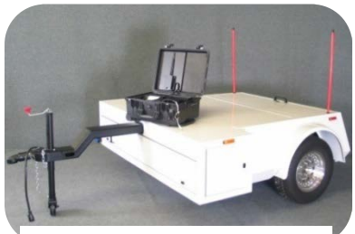
▲ CS9200 Trailer Profiler ▲

Lightweight and Multiple Purpose Profilers: The CS8700 Lightweight Profiler and CS9200 Multiple Purpose Profiling System can access green concrete or hot asphalt quicker than profiling systems mounted on full size vehicles. The CS9200 system works as a lightweight or high speed profiler. Like SSI's other profiling systems, the CS8700 and CS9200 are ASTM E950 Class I devices that are guaranteed to comply with agency specifications. For testing grooved concrete or coarse textured pavements, a wide footprint Gocator laser is used for lower ride values and fewer areas of localized roughness as compared to single point lasers. The CS8700 and CS9200 have the same proven capabilities as SSI's high speed profilers, as the collection system is the same—only the vehicle platform is different. SSI's systems have been designed with support in mind--all core components are portable, replaceable in the field, and are available for express shipment.