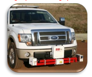
▲ CS9300 Portable Profiler ▲