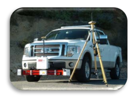
▲ CS9350 GeoProfiler ▲

Mobile Surveying Systems for High Resolution 3-D Topographies: SSI's GeoProfiler<sup>tm</sup> systems combine multiple tracks of laser profile data with cross-slope and corrected GPS. The result is a higher resolution surface topography generated in fraction of the time required under conventional surveying methods. The surface data exports into standard survey formats (PNEZD, PLLHD, GPGGA) for use in road design and machine control applications. The system also serves as a QA/QC testing device under agency ride quality specifications.