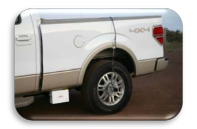
▲ CS9100 Mid-Mount Profiler ▲